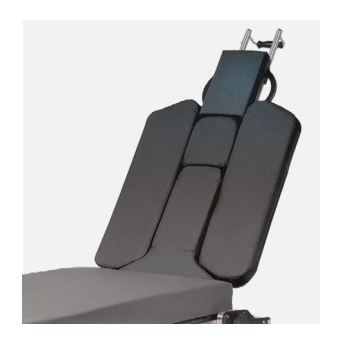
Beach Chair w/ Reusable Pad Set