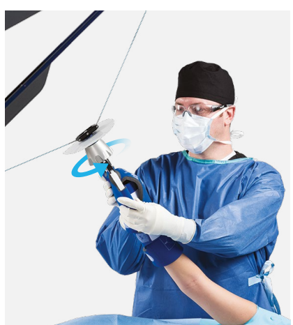
Sterile control of internal/external rotation frees staff to focus on the procedure instead of manual positioning.