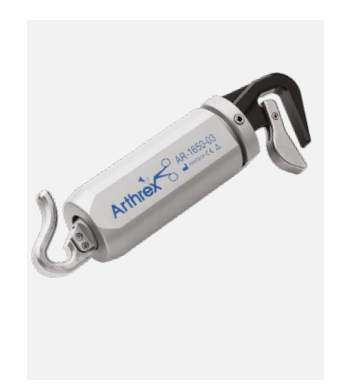
Lateral Traction Sleeve Connector