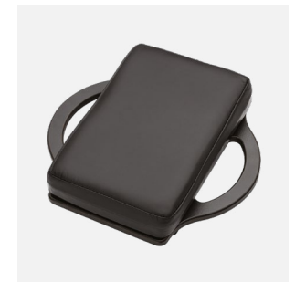
Intubation Pad and Plate