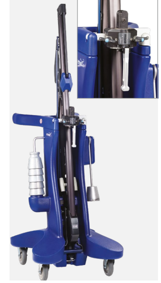
Lightweight, simple to set up, and easy to fold for storage on a convenient cart with a small vertical footprint.