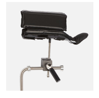
LPS Arm Support