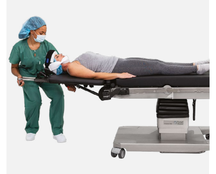
Safe and supportive. Simple adjustments can be made using the lift-support handle.