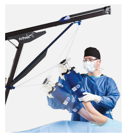
Intraoperative control of abduction/ adduction for ultimate management of direct positioning. The arm can easily be disconnected and reconnected to allow full range-ofmotion testing.