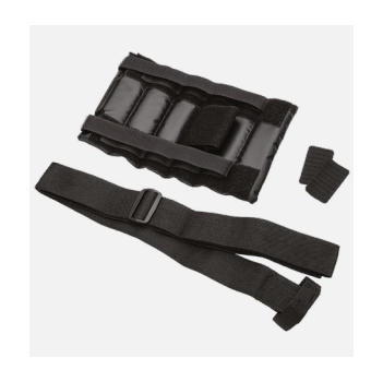
Reusable Security Strap