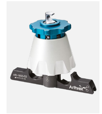
Arm Sleeve Connector