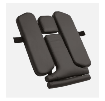
Reusable Pad Set