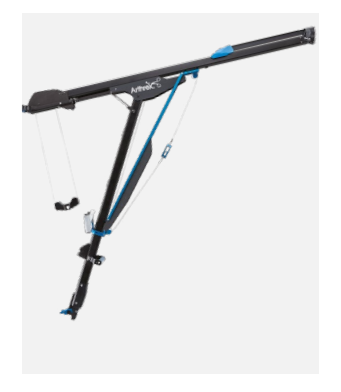
Shoulder Suspension Tower