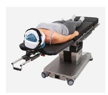
Lies flat for anesthesia access.