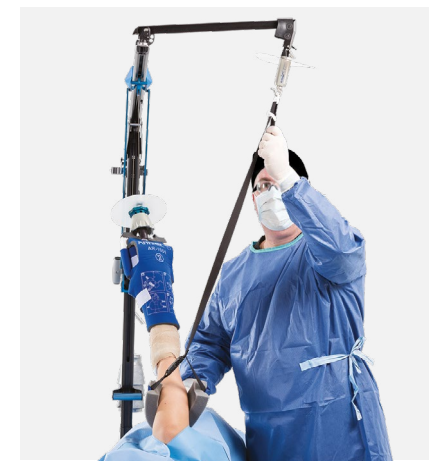
Direct lateral joint distraction is easily applied and can be directed anterior or posterior with a safe and secure padded strap.