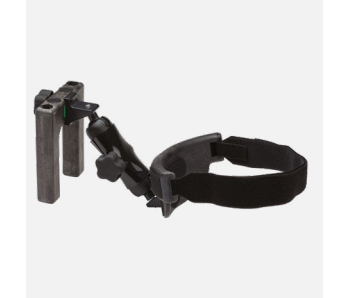
UHP w/out Handles