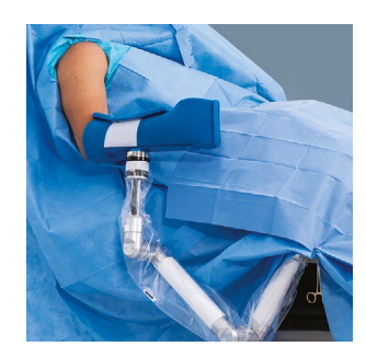
Shoulder and Elbow