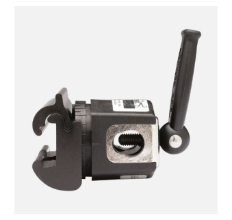
Easy Lock Socket