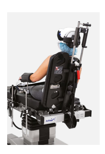
Beach Chair with Components