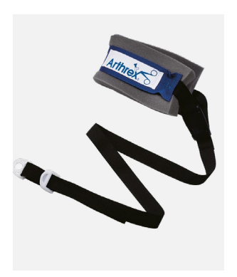
Lateral Traction Sling