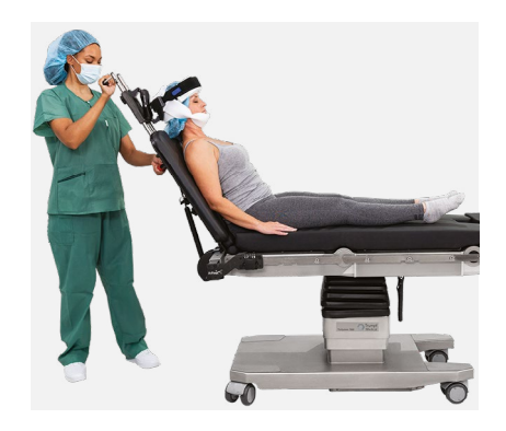
Easy to adjust and position with liftsupport pistons.