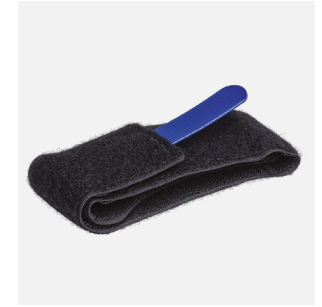
UHP Replacement Strap