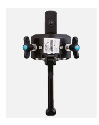
US Clark Rail Clamp