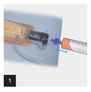
Using a gentle back and forth motion, the adipose tissue is collected into the syringe.

Adipose tissue is harvested through a small incision. In this minimally invasive procedure, your physician will prep and inject your skin with a local anesthetic. They will then introduce a sterile solution to swell, numb, and decrease bleeding at the adipose collection site.