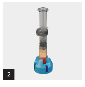
The fat goes through a washing step to filter out unwanted material.