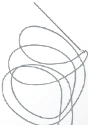
#2 FiberLoop (blue) w/Straight Needle AR-7234

Graft preparation using the Arthrex SpeedWhip technique significantly reduces time spent preparing the graft, uniformly compresses the graft, improves strength and allows for last minute adjustments in graft length. The #2 FiberLoop and #2 TigerLoop are made of a continuous loop of #2 FiberWire® on a thin, straight Nitinol needle. The straight needle is easy to handle, without instruments, and moves freely on the suture to recenter itself after passing through tissue and to facilitate even tensioning.