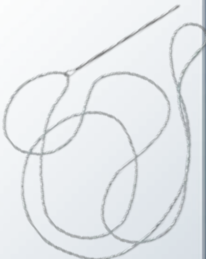
#2 TigerLoop (white/green) w/Straight Needle AR-7234T